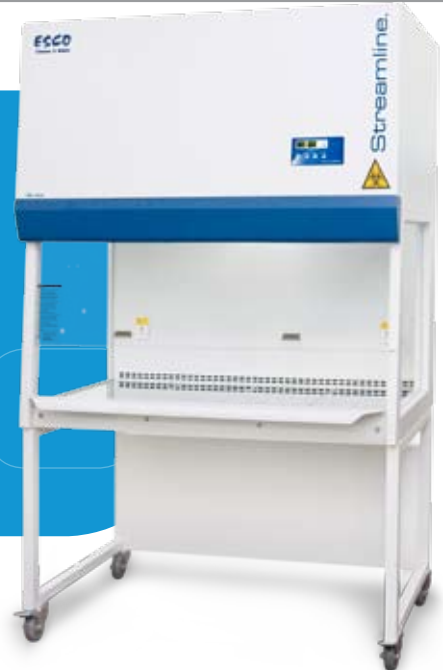
Streamline Class II Biological Safety Cabinet Model SC2-4A_..